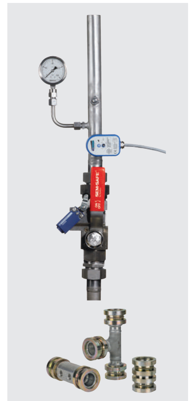
Press fittings and section valve for the accommodation area.