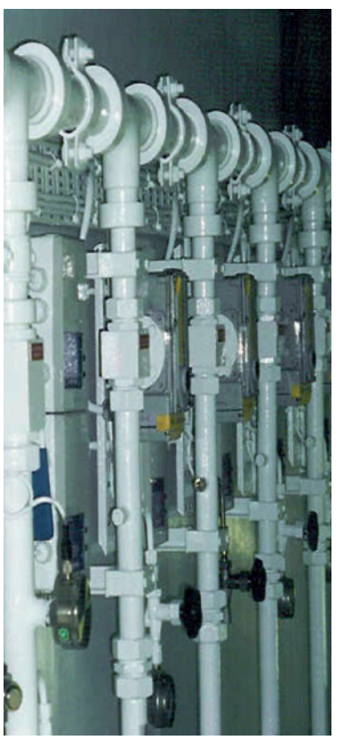
Typical arrangement of section valves in an engine room.