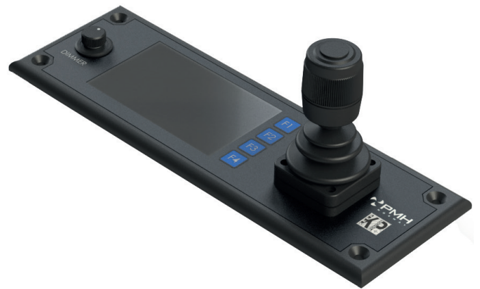
KP Control Panel - Model 2016

PETTER'S MARINE HYDRAULICS has since 1967 manufactured and delivered equipment to the off-shore, fishing, shipping and aquaculture industries, and has in the latest years focused on technologies for advanced control systems for vessel control and maneuvering. Our DP-0 systems known as KP (KEEP POSITION) are easy to integrate in the popular maneuvering systems such as PMHs MPTC (MOTOR, PITCH AND THRUSTER CONTROL) and EPC (ENGINE AND PITCH CONTROL) . The system can also be integrated to other control systems. With PETTER'S MARINE HYDRAULICS' vessel control systems a vessel will be able to operate in more demanding environments and tougher conditions, providing EXCELLENT performance and high RELIABILITY in a COST EFFICIENT way. KP-100