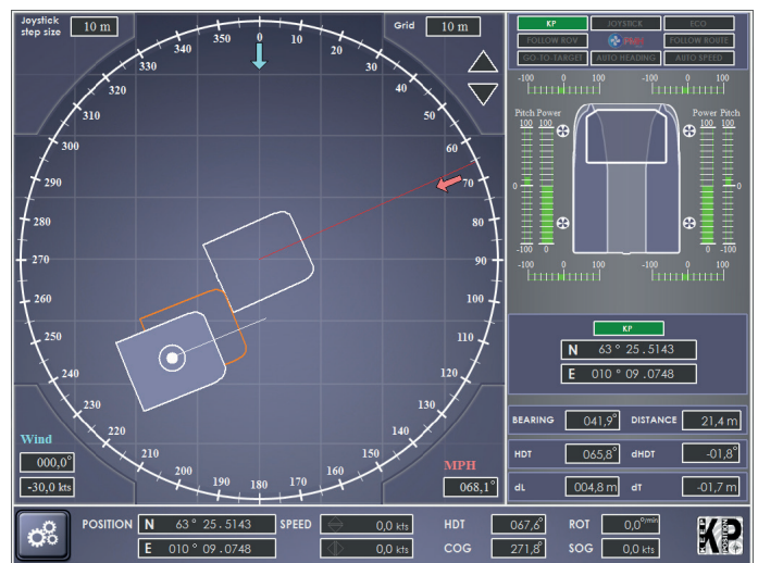
Operator display for KP-200 and KP-300

The KP system is now available with its brand new panel with an improved and more userfriendly graphical user interface (GUI). The GUI only displays data necessary to the operator for the given operation, reducing the risk for information overload and contributes to a better working environment for the users.