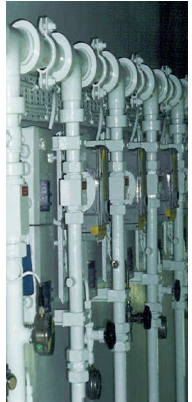
Typical arrangement of section valves in an engine room.