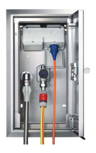
KEMPER 'Tresor' Figure 210, (H / W / D: 470 x 250 x 120 mm)